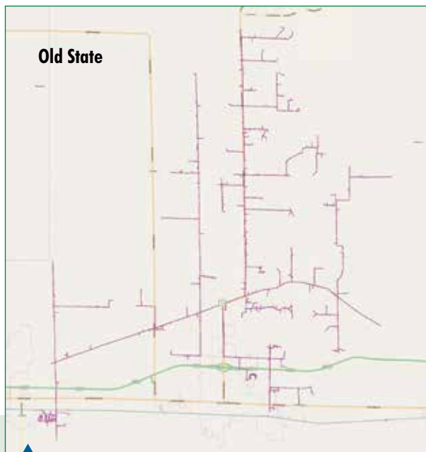
Trees will be cut and poles treated in the area served by the Old State Substation.

work in late spring and should be done sometime during the summer of 2015. Osmose will be using both pickup trucks and 4-wheelers to move from pole to pole, inspecting and treating them. Please do not hesitate to call the office at 618-526-7282 between 7 a.m. and 4 p.m. if you have any questions or concerns.