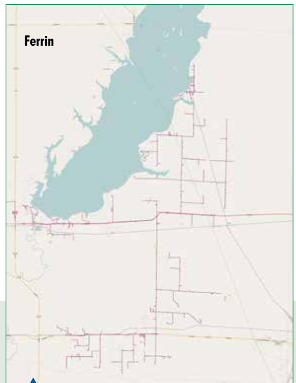
Trees will be cut in the area served by the Ferrin and Bartelso Substations.