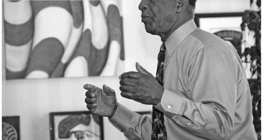
Secretary of State Jesse White addressed students at Youth Day.