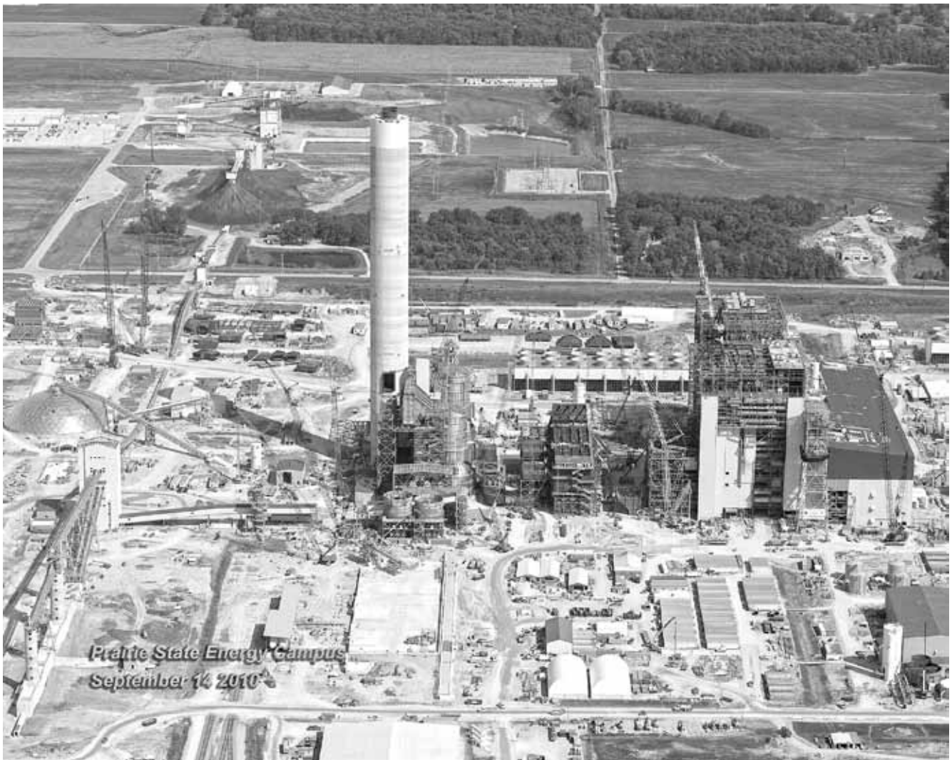
Conditional permission has by granted to use this material.